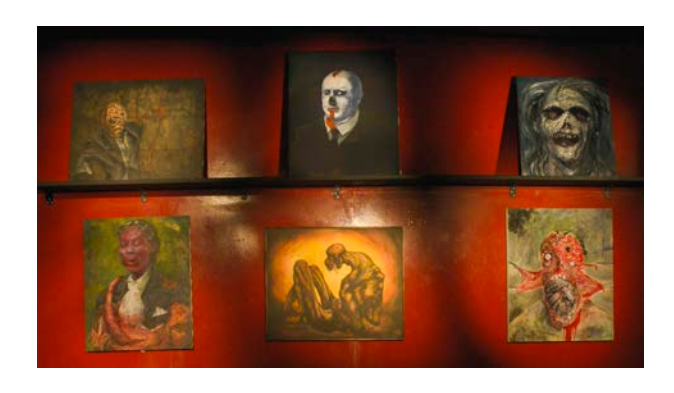
Fig. 2 Six paints on the wall in the garalley

Six paints whose theme was a zombie were exhibited in order to making visitors recognize that this hall was a zombie museum (Fig. 2). A device using a IR sensor and an air compressor was installed at the halfway. The device frightened visitors by blowing air. The 6th paint to which IR sensor was attached was moving, when visitors walked away in front of the paint.