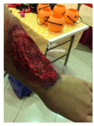
Fig. 11 Make up samples