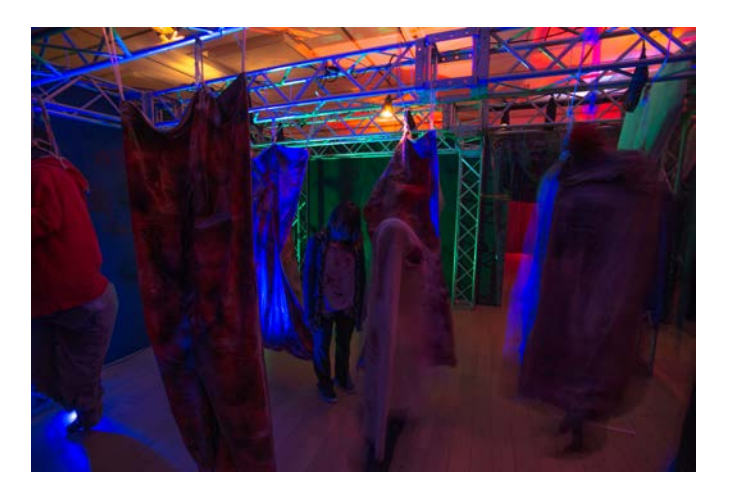
Fig. 8 Exibitions in cooled room

Eight zombies and four corpse storage bags hang from the ceiling (Fig. 8). One of zombies hang by rope that could swing with a motor. An actor who plays a zombie was appeared too.