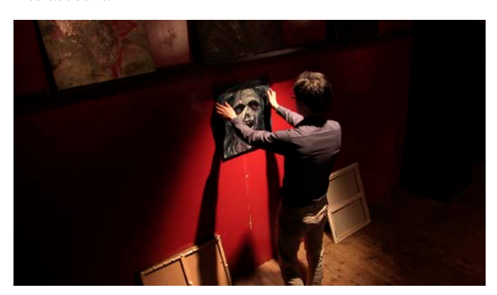
Fig. 12 A scene of advertisement video

Contents of research resources about zombies corresponded with the story set in advance. To matching the story with advertisement took recent haunted attraction's characteristic into account.