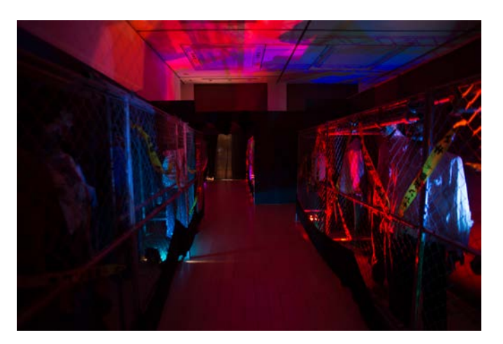
Fig. 10 Exibitions in storeroom

Twenty four pairs of zombies were put in the wire net of the side wall of the pathway (Fig. 10). The wire net was arranged double. Two metal net which were moved with a motor made metal sound. And more, two actors who play zombies chased visitors from the front and the back. They were giant zombies.