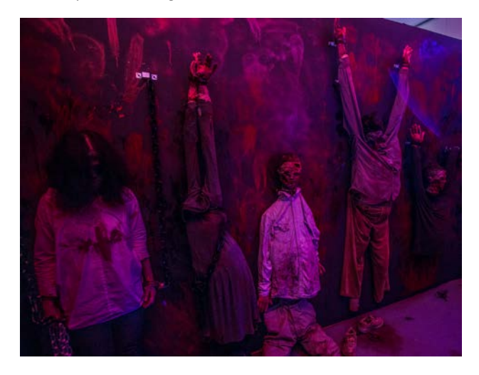
Fig. 6 Exibitions in laboratory on a living zombie

Four zombies' dolls crucified were exhibited on the wall (Fig. 6). And more eight zombies' doll were exhibited in a cage. One of four zombies on the wall was an actor and he frightened visitors when visitors' attention were caught by the cage. No light threw the actor and light in the cage was flashed in order not to visitors' attention toward the wall.