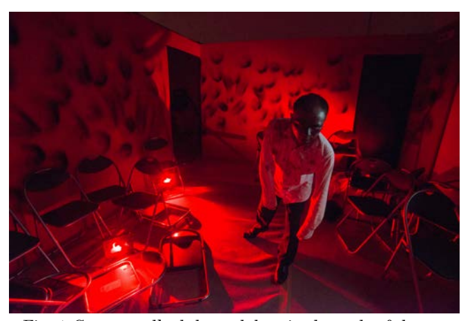
Fig. 4 Guests walked through barricade made of chars.

In this area zombies' heads, hands, fingers and so on were exhibited (Fig. 3). They were more concrete than previous area's exhibition. Visitors walk through gap of barricade which was made of chairs piping up (Fig. 4). There were bloody dead bodies on the narrow pathway. Visitors walked through the museum and viewed exhibitions so far. Hereafter, visitors walk though backyard of the museum. Hereafter, there were not exhibitions like a museum.