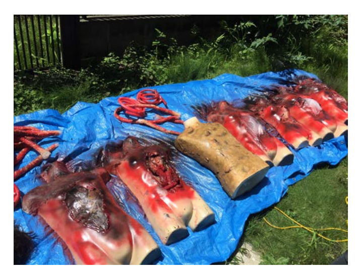
Fig. 14 Painted zombie's body samples