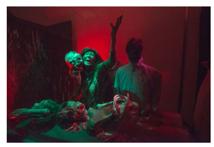
Fig. 5 Exibitions in locker room

There were ten lockers and a gimmick was installed each locker. When opening one locker, chewing sound occurred. While opening other locker, curtain was swinging by means of a fun. When visitors' attention were caught by lockers, actors who played zombies frightened visitors (Fig. 5). This zombie needed to wait at evacuation passage of the side of the lobby. Because he need to play a role in throwing goods in the lobby. Stuffs could went in and out back of the locker from the .