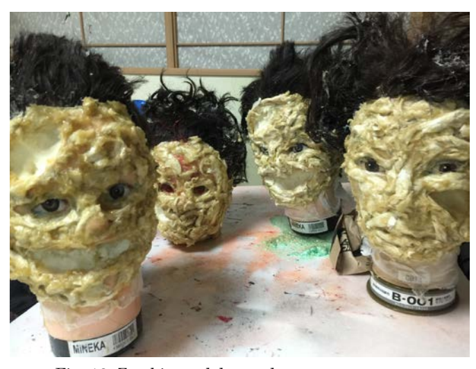
Fig. 13 Zombie model samples

hollow with lacquer and gloss. Because they were dark and dull, when we painted it with water-based acrylic coat (Fig. 14). More ever, clotted blood was dropped on it.