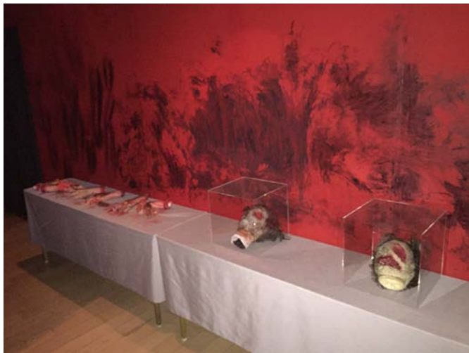
Fig. 3 Exibitions in audiovisual room