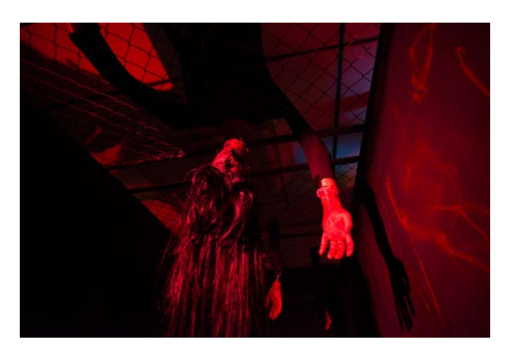
Fig. 9 Exibitions in decontamination room