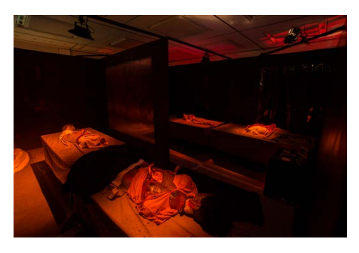
Fig. 7 Exibitions in dissection room